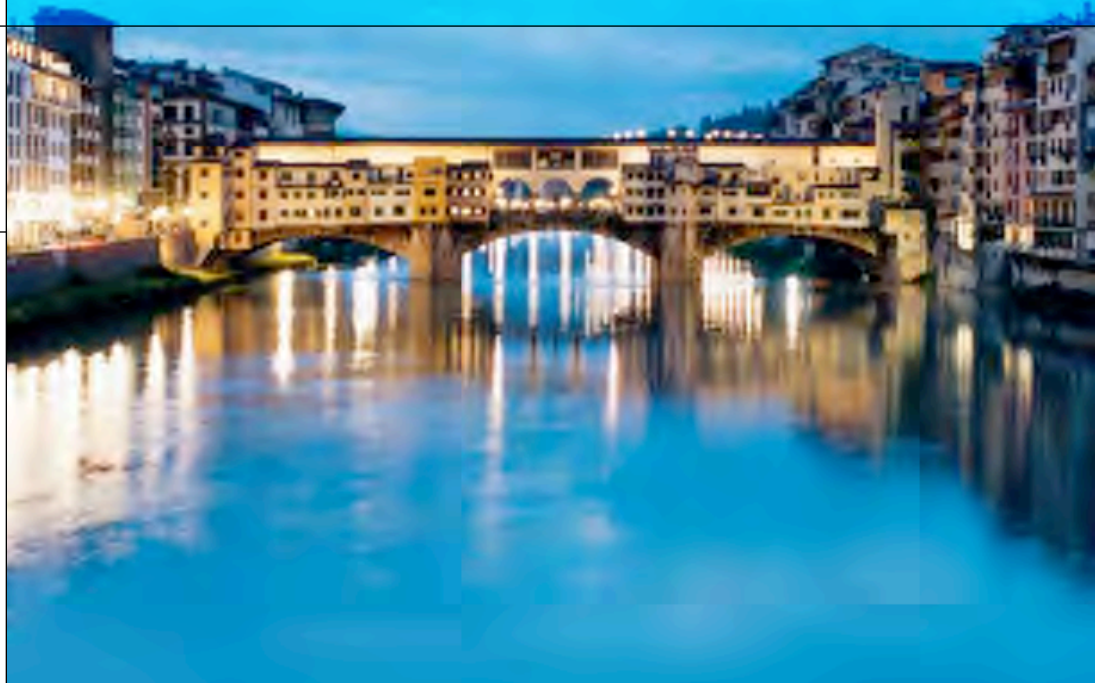
Florence rests along the Arno River and is the birthplace of the Italian Renaissance.

Experience the vast legacies of Venice, Florence and Rome. Study the architecture of Venice's picture-perfect palaces and imagine the centuries-old culture that is still visible in this water wonderland. Discover how Florence's Renaissance introduced the world to opera, artistic genius and Machiavellian politics. In the Eternal City, encounter the enduring influence of emperors and popes who shaped the course of world history.